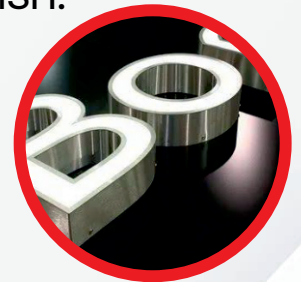
Aluminium Channel Letters